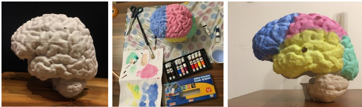
Figure 1. 3D design, painting of the brain model, drilling of the lobes

The 3D brain model, the main component of the designed model, was obtained with a nature-friendly material called PLA using a 3D Printer. Using acrylic dye, the brain lobes were painted in different colors based on the corresponding picture in the biology textbook of the Ministry of Education. A hole was drilled into each lobe of the right hemisphere of the brain using a drill (Figure 1).