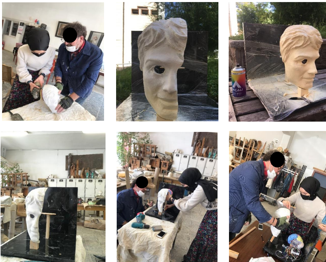
Figure 3. Creating the mask and table

The face mask designed for the front lobe of the brain, was prepared in a sculpture workshop. Firstly, the mask was modeled from clay, then placed in a plaster mold and a fiber casting was performed. The face mask was then sprayed with paint. Two square boards of 40x40 cm were attached to each other at a 90° angle to form the table. Wooden pieces to enable the 3D brain and face mask to be positioned were placed on the table. The mask and brain model were fixed on these parts with a drill. Sensors were attached to the relevant parts of the mask using a silicone gun. Holes were drilled in the 4 corners at the base of the table and the switches were added (Figure 3).