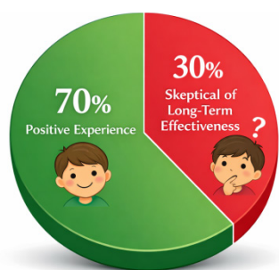
Fig. 1. Attitudes to CBT Effectiveness

“I know what we are expected to do, though when I am in a classroom and I get nervous I forget what we learned. It is not simple to implement it into practice”.